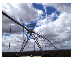
Water Resource Management