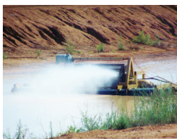
Testing & Monitoring